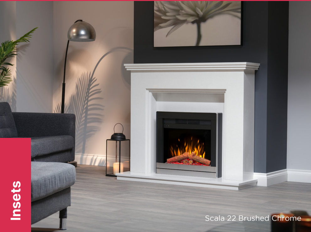
Scala 22 Brushed Chrome